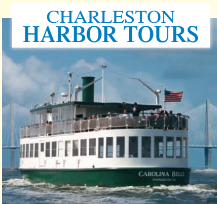
Harbor Tours depart from the Charleston Maritime Center, 10 Wharfside St., approx. one block south of the South Carolina Aquarium.

Children must be accompanied by an adult (up to 3 kids per adult). This offer good for Jan.29, 2012 only.